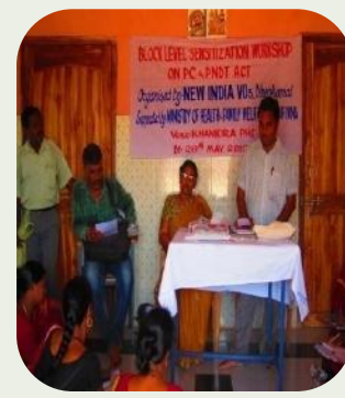
Awareness on PC & PNDT