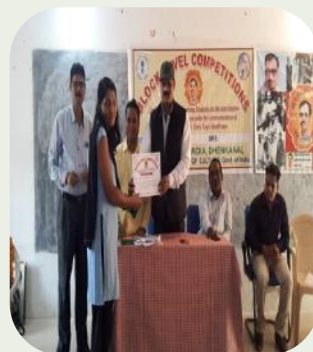
P.T. Deendayal Upadhyay Birth Day