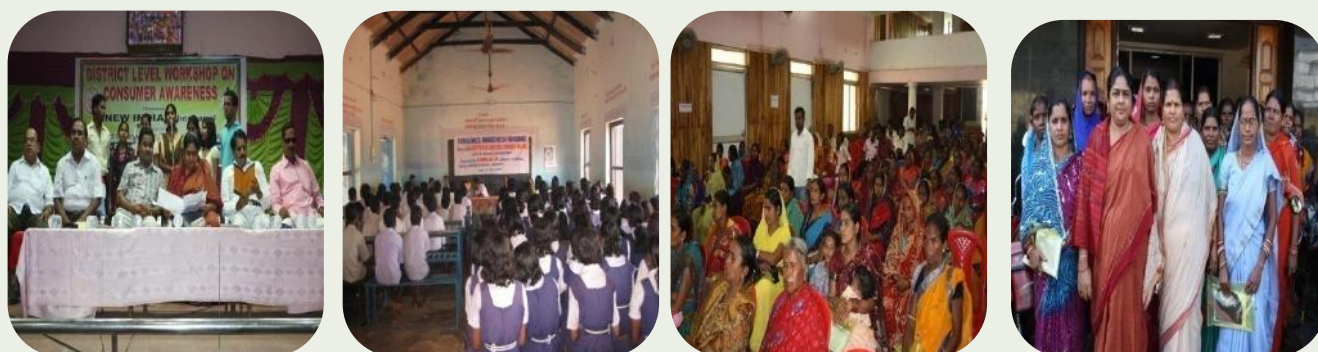
Consumer Awareness & Counseling Centre