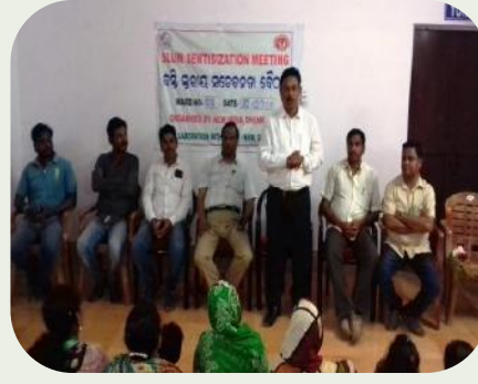
Slum Sensitization Programme in Dhenkanal Municipality Area