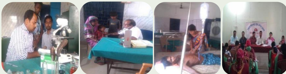
DADARAGHATI PHC (N), PARJANG, DHENKANAL