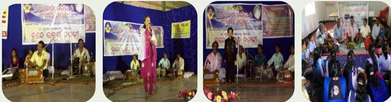
Running of NEW INDIA Sangeet Natak Lalit Kala Vidyalya