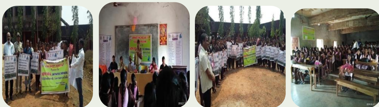
Road Safety Awareness