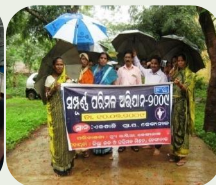
Awareness on Total Sanitation and Swachha Bharat Abhiyan