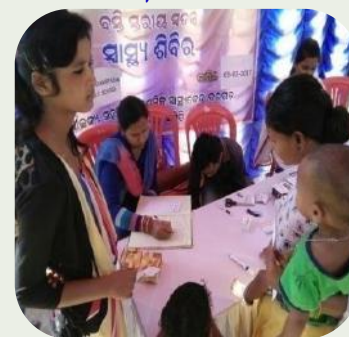
UPHC-2, STATIONPADA, BARGARH