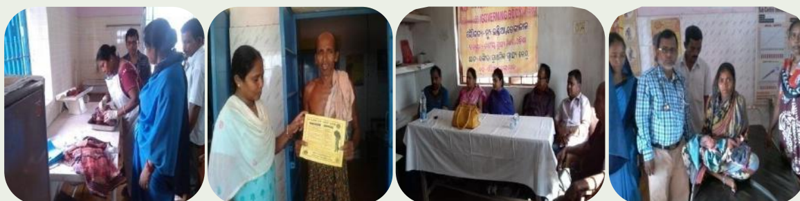
KHANKIRA PHC (N), GONDIA, DHENKANAL