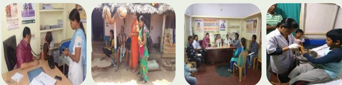
UPHC, BIDYADHARPUR, BARANG, CUTTACK