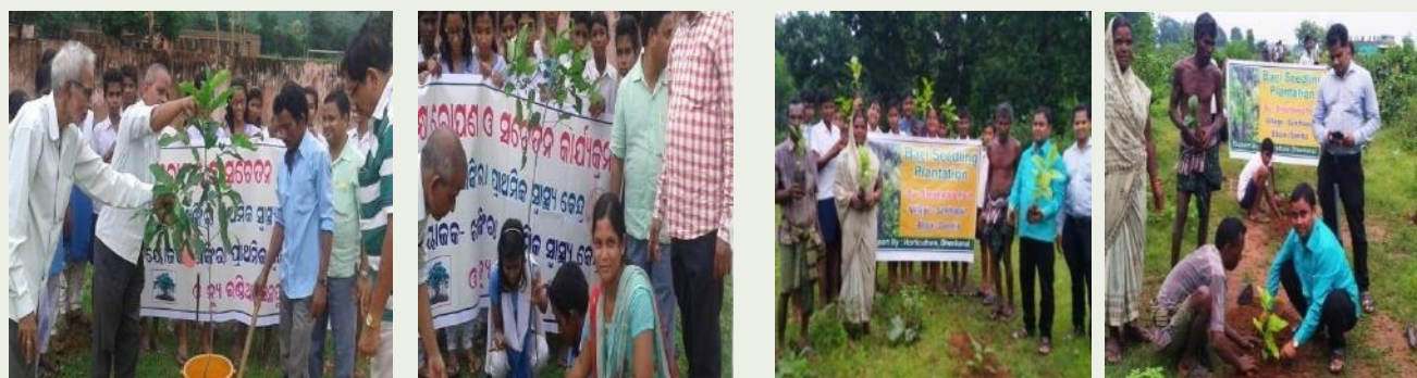
Plantation Programme & Bael Plantation