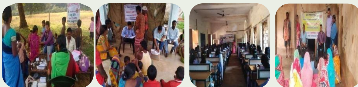
AROGYA PLUS (MHU), KANKADAHAD, DHENKANAL